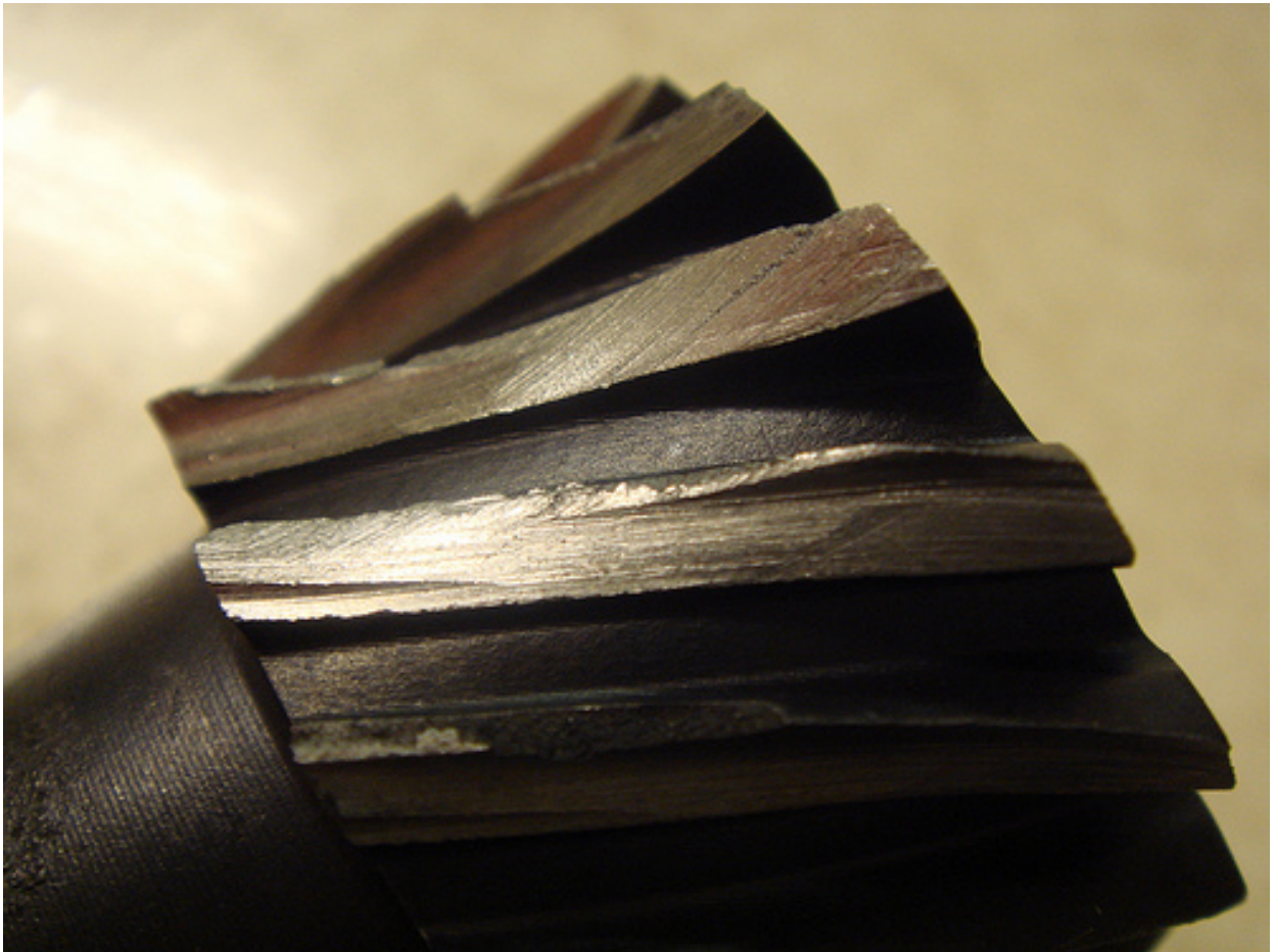
ICN-PUMP-A-732003-0-00000-00002-A-001-01 Fig 2 Inspect the rotors