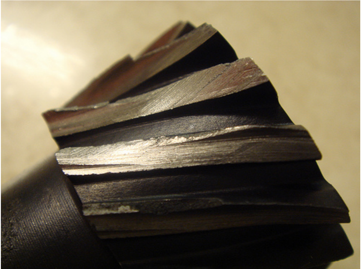
The Rotors cracks and fouling